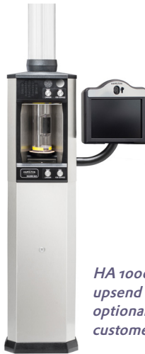
HA 1000-XLR upsend with optional customer video